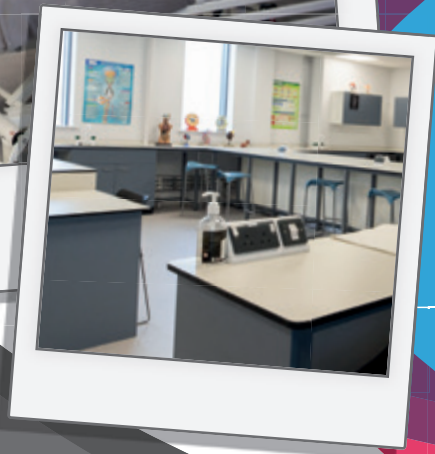
Health Science Labs