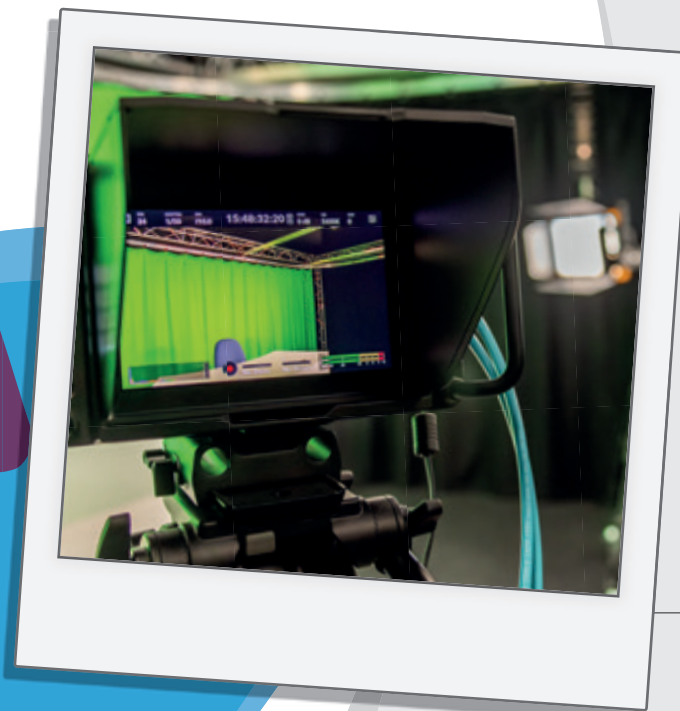
Broadcast Media Suite