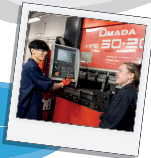
Advanced Construction Centre